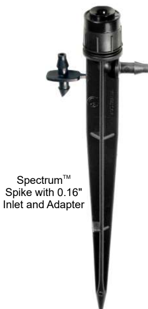
Spectrum™ Spike with 0.16" Inlet and Adapter