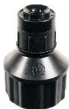
Spectrum™ Thread 1/2" FNPT