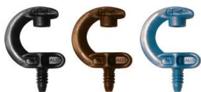
Cfd™ Downspray Range