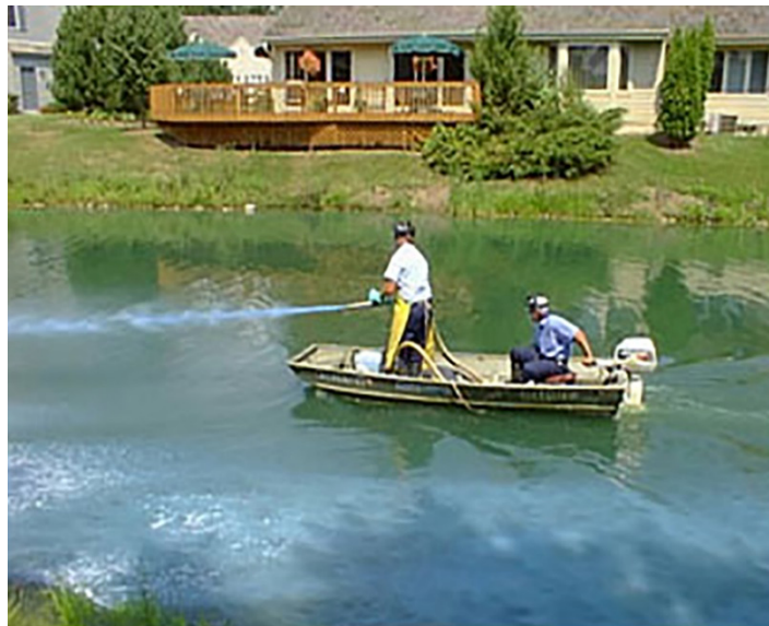
Figure 1. For use in: impounded waters, lakes, ponds, irrigation systems and reservoirs; also in sewers and septic tanks