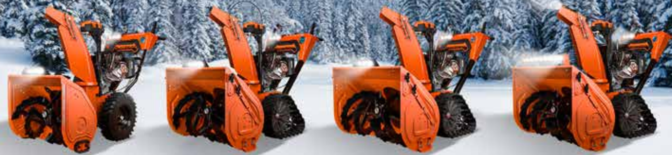
GREAT LAKES EDITION

SPECIAL EDITION SNO-THROS® EXCLUSIVELY FROM ARIENS®