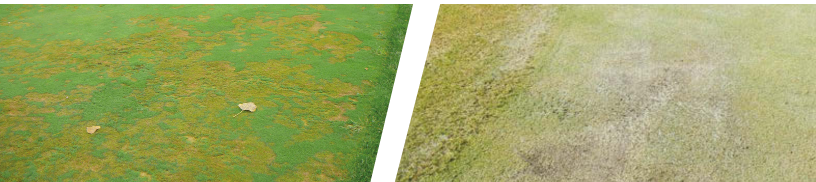
Symptoms of Pythium blight on a creeping bentgrass tee versus Pythium blight on a bermudagrass green.

Treatments applied July 10 and 17, and plots infested July 12. Disease severity is shown for disease development on July 21. Plant Disease Management Reports 4:T048