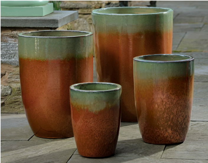
Shown in Falling Green Sierra