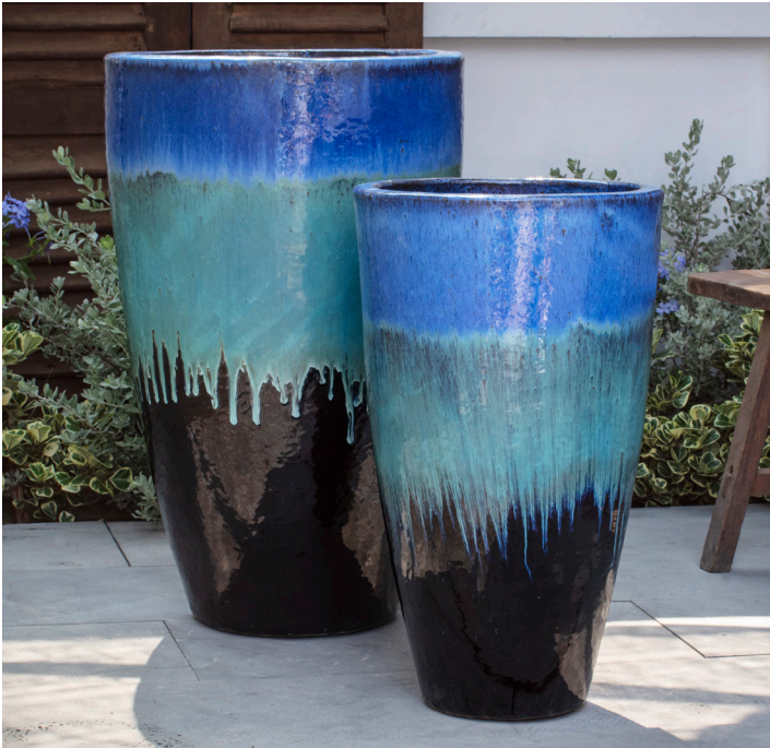
Shown in Running Blue/Brown