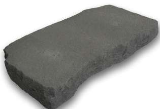
6" Rise - 440 pounds 45" x 22" x 6"