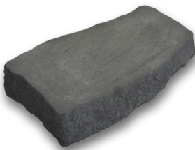
6" Rise - 395 pounds 41" x 23" x 6"