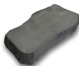
6" Rise - 370 pounds 43" x 22" x 6"