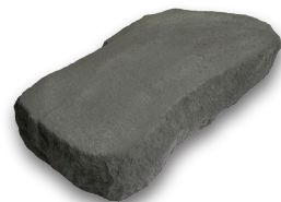
6" Rise - 420 pounds 43" x 23" x 6"