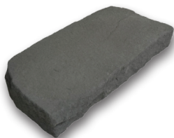
6" Rise - 425 pounds 45" x 21" x 6"