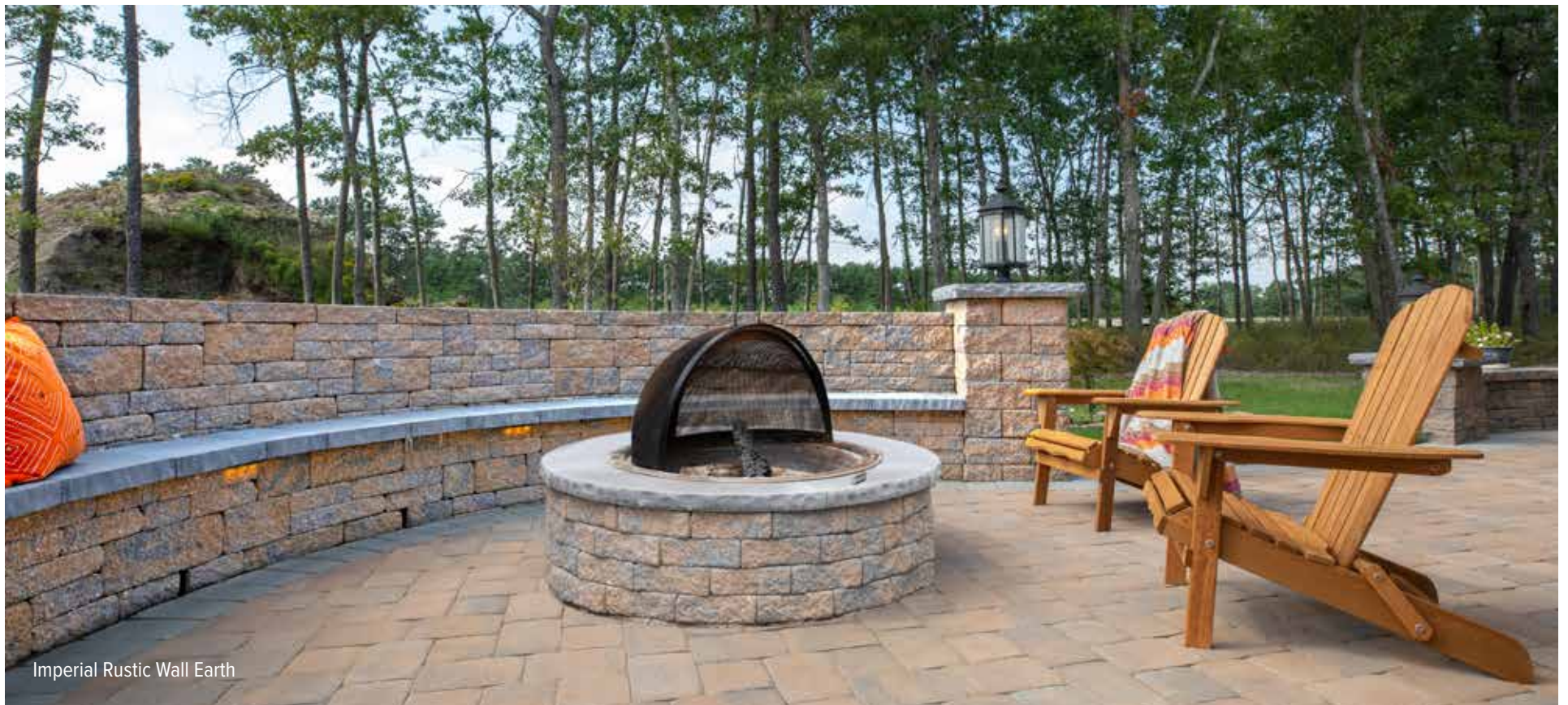
Imperial Rustic Wall Earth