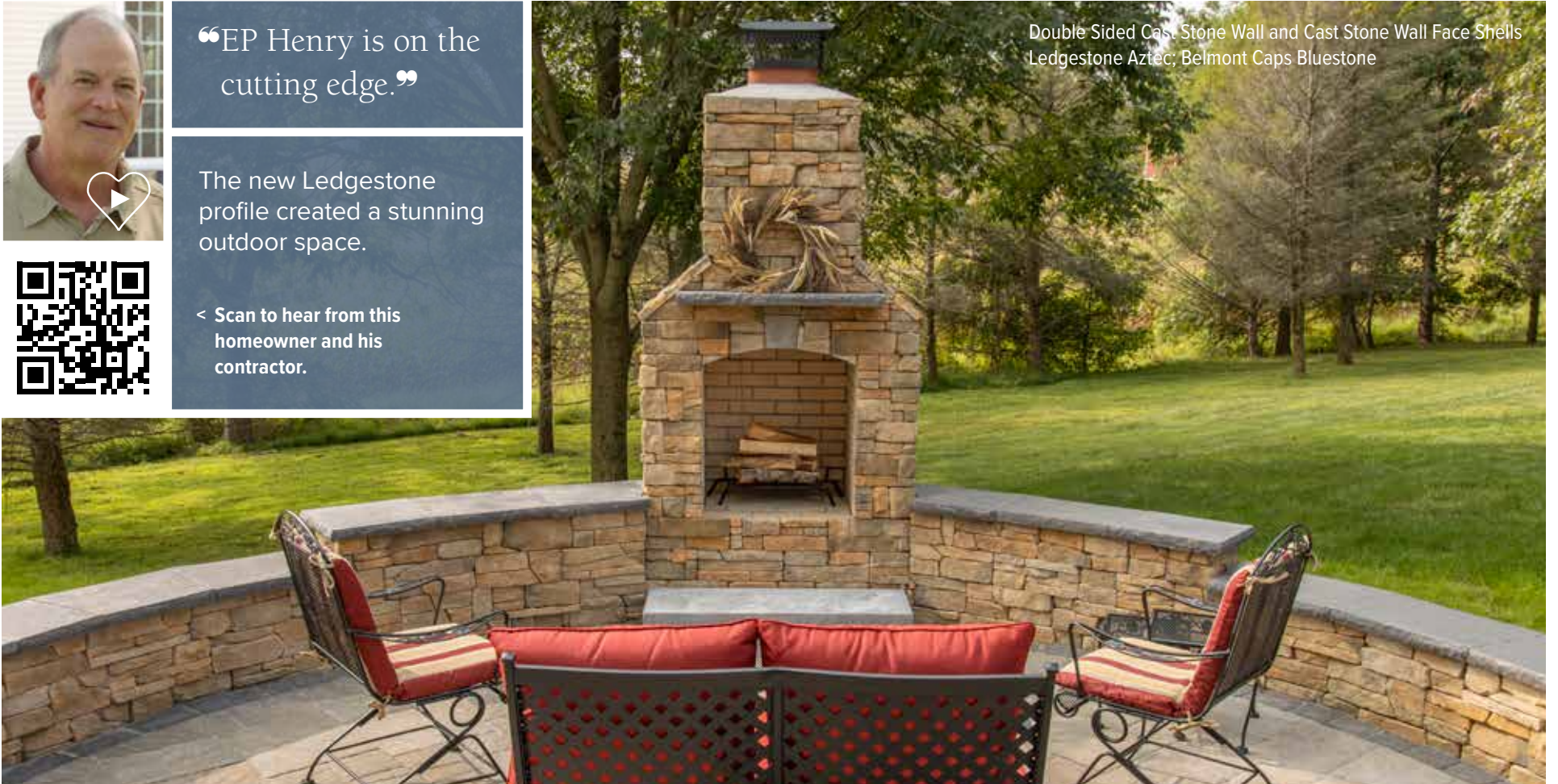
Double Sided Cast Stone Wall and Cast Stone Wall Face Shells LedgeStone Aztec, Belmont Caps Bluestone

< Scan to hear from this homeowner and his contractor.