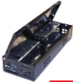
LITTLE PETE® No. 423-BK WITH SOLID LID AND BLACK POWDER COAT