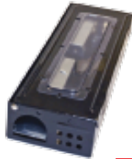
LITTLE PETE® No. 423CL-BK WITH INSPECTION WINDOW AND BLACK POWDER COAT