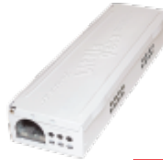
LITTLE PETE® No. 423-WH WITH SOLID LID AND WHITE POWDER COAT