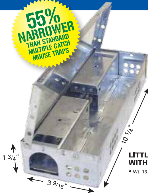
LITTLE PETE® WITH SOLID LID

55% NARROWER THAN STANDARD MULTIPLE CATCH MOUSE TRAPS