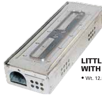
LITTLE PETE® No. 423CL WITH INSPECTION WINDOW