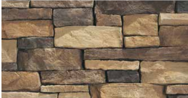
Durango® Mountain Ledge