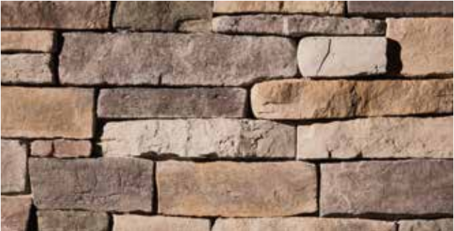
Walnut Ridge Mountain Ledge