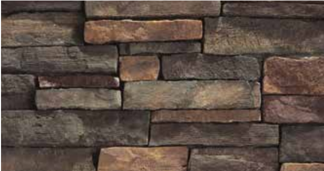
Mesa Verde® Mountain Ledge