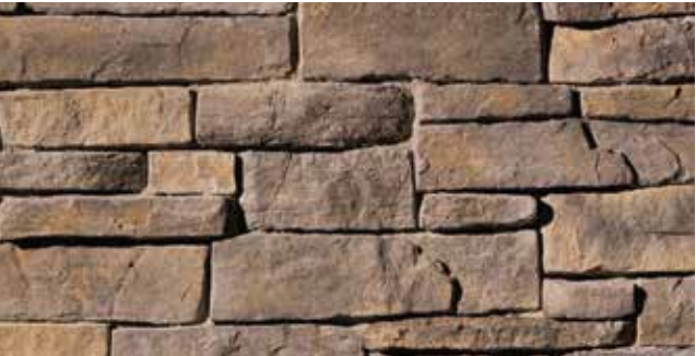
Asheville Mountain Ledge