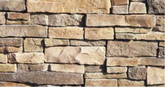
Pioneer® Mountain Ledge Panels