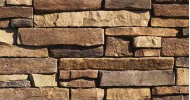
Russet® Mountain Ledge Panels