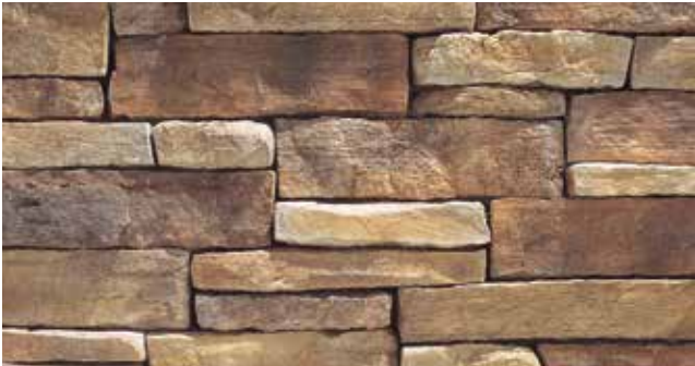
Yukon® Mountain Ledge