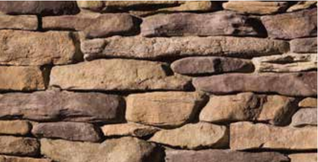
Olive Grove Bluffstone