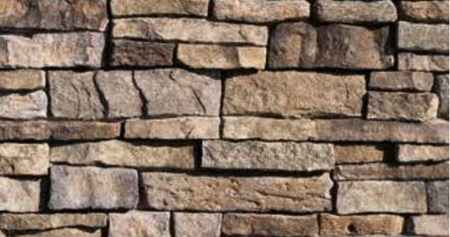
Silverton® Mountain Ledge Panels