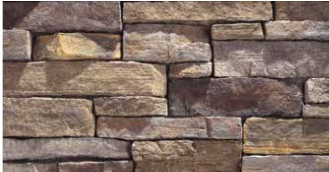
Sierra® Mountain Ledge