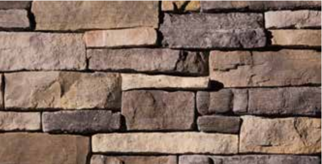
Charleston Mountain Ledge