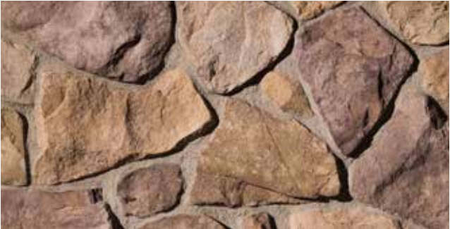
Millstream Country Rubble