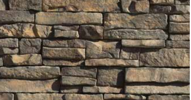
Whiskey Creek® Mountain Ledge Panels