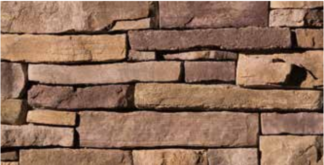
Lexington Mountain Ledge