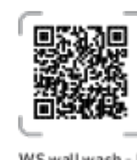
WS wall wash - LED board lamp replacement