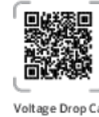
Voltage Drop Calculator