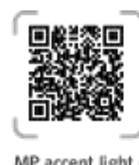
MP accent light - LED board lamp replacement