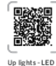
Up lights - LED board replacement