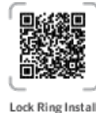
Lock Ring Installation