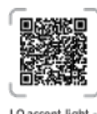
LO accent light - LED board lamp replacement