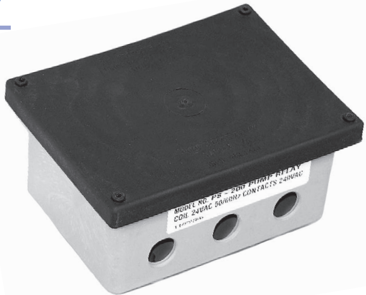
PS-200 2 HP Pump Start Relay Single Phase