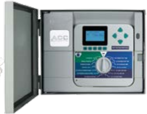
Metal Wall Mount (gray or stainless)