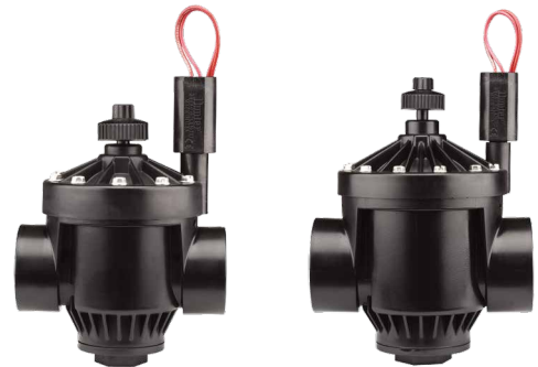
PGV-151 Inlet Diameter: 1½" Height: 7½" Length: 5¾" Width: 4½"