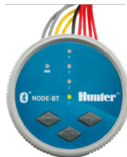
NODE-BT Diameter: 3½" Height: 3"

The Bluetooth® word mark and logos are registered trademarks owned by Bluetooth SIG Inc. and any use of such marks by Hunter Industries is under license. iOS is a trademark or registered trademark of Cisco in the U.S. and other countries and is used under license. Android is a trademark of Google LLC.