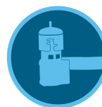
Mini-Clik Sensor Page 135