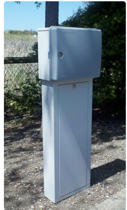
WeatherTRAK LC Central Shown with Pedestal Option

Learn more at HydroPoint.com/LC or call 1 (800) 362-8774 to schedule a demo.