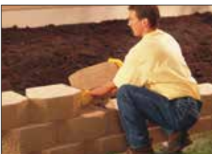
3. Install Additional Courses

Backfill first course units with clean granular fill material (i.e. crushed stone/gravel). DO NOT USE PEA GRAVEL! Compact with hand tamper or appropriate mechanical compactor. Backfill and compact behind each course before installing additional courses.