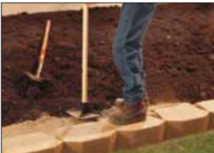
2. Place & Compact Backfill

At wall location, dig shallow trench for wall base (see Typical Legacy Stone Section). Place granular leveling pad material. Compact and level the base pad. Place and level the first course units. If grade changes along base of wall, create stepped leveling pad as required. Always start wall at lowest elevation, working to highest. Complete base course before proceeding with additional courses.