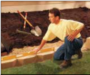
1. Prepare Wall Location

At wall location, dig shallow trench for wall base (see Typical Legacy Stone Section). Place granular leveling pad material. Compact and level the base pad. Place and level the first course units. If grade changes along base of wall, create stepped leveling pad as required. Always start wall at lowest elevation, working to highest. Complete base course before proceeding with additional courses.