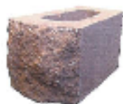
SMALL UNIT 6"H x 7"W x 12"D