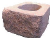
MEDIUM UNIT 6"H x 11"W x 12"D