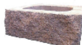
LARGE UNIT 6H x 18"W x 12"D

All 3 sizes sold on one pallet. One pallet = 22.5sqft.