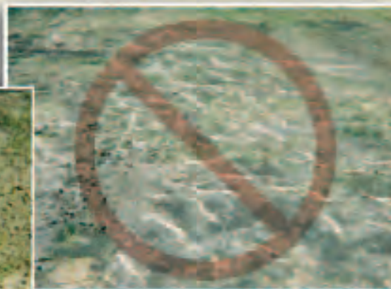
70/30 WOOD/PAPER + 3" RAIN