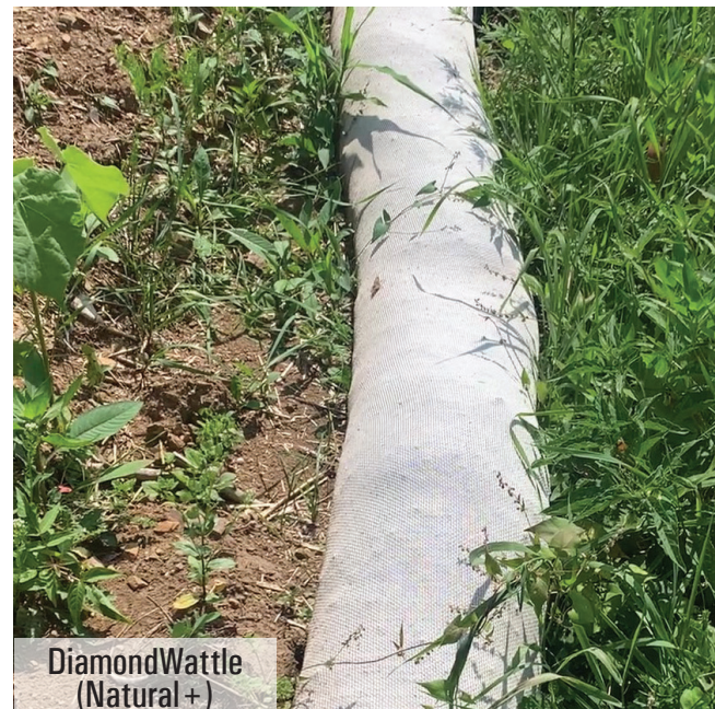
DiamondWattle (Natural +)