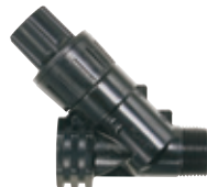
3/4" HIGH FLOW