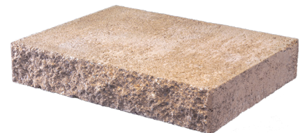
3" Universal Cap