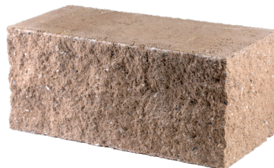
Solid Corner Unit