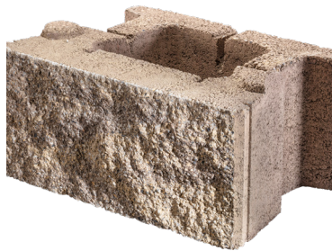
CornerStone 100 Unit (Shown Upside Down)