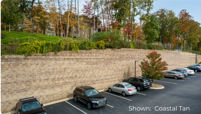
Shown: Coastal Tan