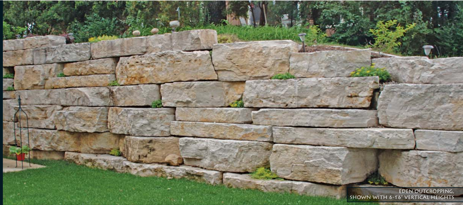
EDEN OUTCROPPING, SHOWN WITH 6-16" VERTICAL HEIGHTS

Eden Outcropping – Available in gray, buff and golden tones.