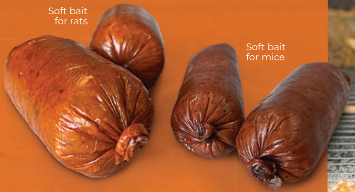
Soft bait for mice