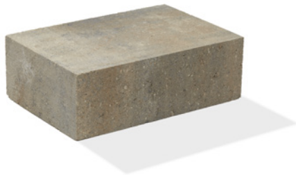
Standard Unit 11.44" x 3.82" x 7.63" (291 x 97 x 194mm) Individually Packaged