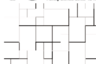
Random Ashlar - 4 piece