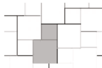
2 Piece Step-up