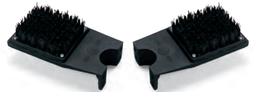
DOUBLE PIPE MOUNT SPIKE BRUSH