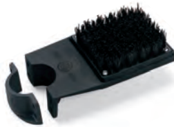
SINGLE PIPE MOUNT SPIKE BRUSH