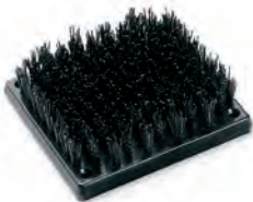
SPIKE BRUSH PARTS BASE BRUSH