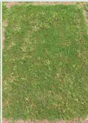
MSMA applied 40 fl oz/A + Sencor® 75 herbicide applied 2.7 fl oz/A