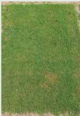
Tenacity® herbicide applied 8 fl oz/A + Princep® Liquid herbicide applied 20 fl oz/A + Pennant Magnum® herbicide applied 21 fl oz/A