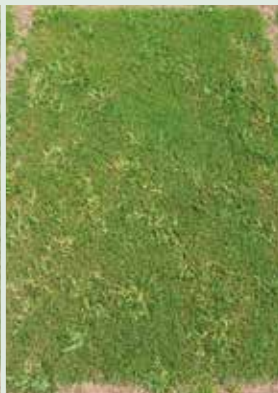
Revolver® herbicide applied 26 fl oz/A + Sencor applied 2.7 fl oz/A