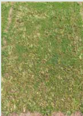
Untreated goosegrass trial