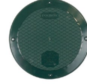
12" HD Flat Cover (for corrugated pipe) 3004-C