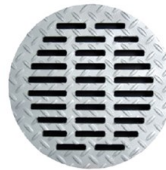
12" Galvanized Steel Grate (for Polylok risers and D-Boxes) 3017-ME