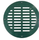
12" HD Flat Grate (for corrugated pipe) 3004-GR