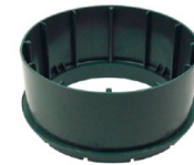
12" x 6" Tall Riser 3017-R