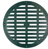
12" Flat Grate (for Polylok risers and D-Boxes) 3017-GE