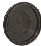
4" D-Box Seal & Nut 3001-SN