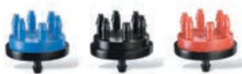
XB-05-6, XB-10-6, XB-20-6