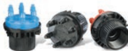
XBT-05-6, XBT-10-6, XBT-20-6