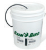
XQ-1000-B 1/4" Tubing