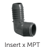
Insert x MPT