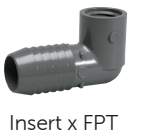
Insert x FPT