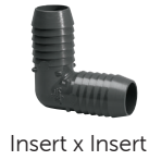
Insert x Insert