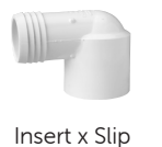
Insert x Slip