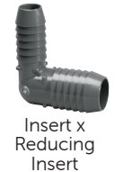
Insert x Reducing Insert