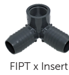
FIPT x Insert