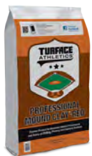
Turface Professional Mound Clay Red®

No areas around the diamond or in the bullpen receive more wear and tear than pitcher's mounds, batter's boxes and catcher's boxes. It is crucial these areas be properly maintained to assure on-the-field safety and playability, pitch after pitch. Whether it is new construction, a renovation or post-game maintenance, more groundskeepers, volunteer coaches and parents rely on the lasting performance and durability provided by Turface Professional Mound Clays® and MoundMaster Blocks®, 5 Star™ Packing Clay and Turface MarMound All Purpose Packing Clay®. The reason: the right foundation under foot gives athletes at every level of play the confidence to compete to the best of their abilities. And that foundation begins with the best clays in the industry.