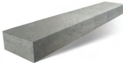
72" STEP 20 x 70¾ x 7" 500 x 1800 x 180mm

2 Edge details available on the same unit (Chamfer and rounded).