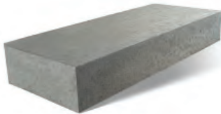
48" STEP 20 x 47¼ x 7" 500 x 1200 x 180mm