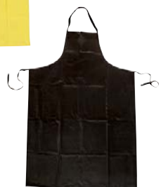
K. No. 4T295