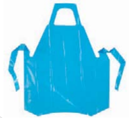
A. No. 12Y507