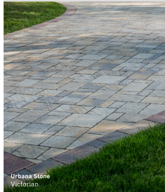
Urbana Stone Victorian