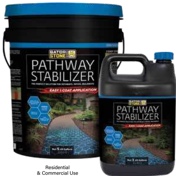
Residential & Commercial Use

Gator Stone Bond is a unique blend of acrylic polymers designed to bind together a wide variety of small aggregates commonly referred to as DG (decomposed granite): pathway mixes, crusher runs, concrete sand, etcetera.