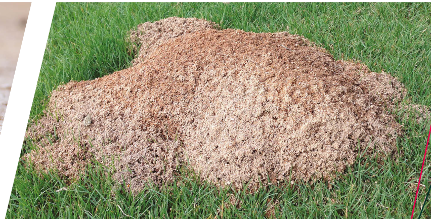
Fire ant mound in turfgrass. (Bayer)