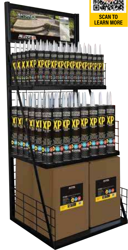
23.5"W x 59"H x 20.75"D (59.7 W x 150 H x 52.7 D cm)