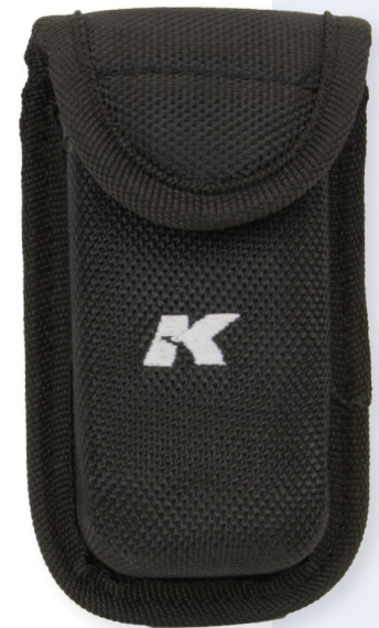
Carrying case included