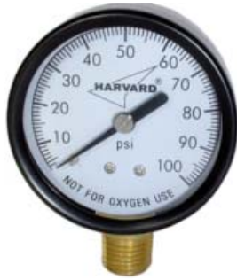
IPPG or IPG Series