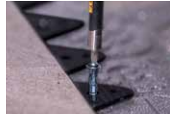
5/8" (15mm) height

For use on: GATOR TILE EDGE are use to support, stabilize and offer a strong lateral support for the perimeter of a porcelain tile installation for a patio, sidewalk, pool surrounding & terrace, fasten to the Gator Base with the help of the Gator Base Screws .