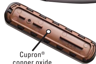
Cupron ® copper oxide