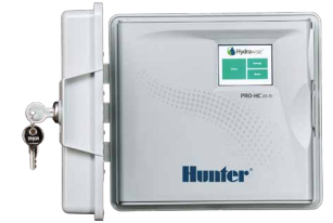
Pro-HC (plastic outdoor) Height: 22.8 cm Width: 25 cm Depth: 10 cm