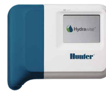
HC (plastic indoor) Height: 15.2 cm Width: 17.8 cm Depth: 3.3 cm