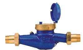
HC Flow Meter * See details on page 138