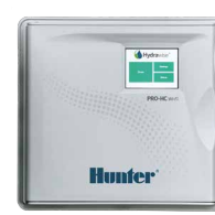
Pro-HC (plastic indoor) Height: 21 cm Width: 24 cm Depth: 8.8 cm