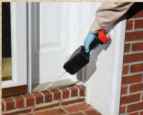
Dusting Nibor-D under along windows