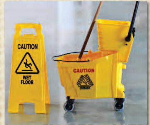
Using Nibor-D as a mop solution