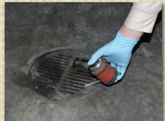
Dusting Nibor-D in drains