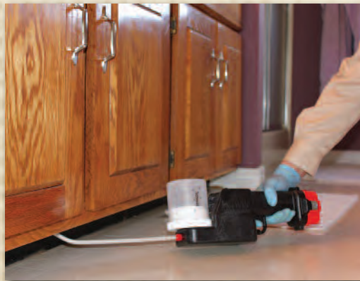
Dusting Nibor-D under cabinets