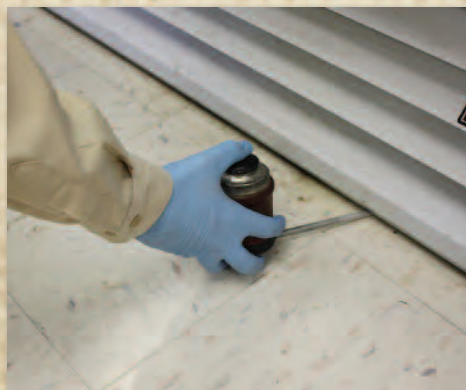
Dusting Nibor-D under refrigerator