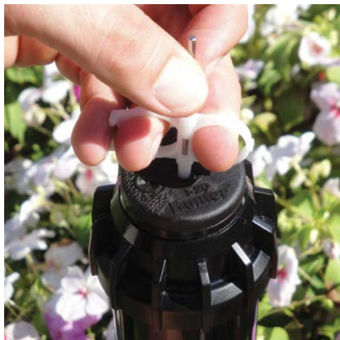
I-20 can be turned off at the head if needed

I-20-12 Overall Height: 17" Pop-up Height: 12" Exposed Diameter: 1¾" Inlet Size: ¾" female NPT