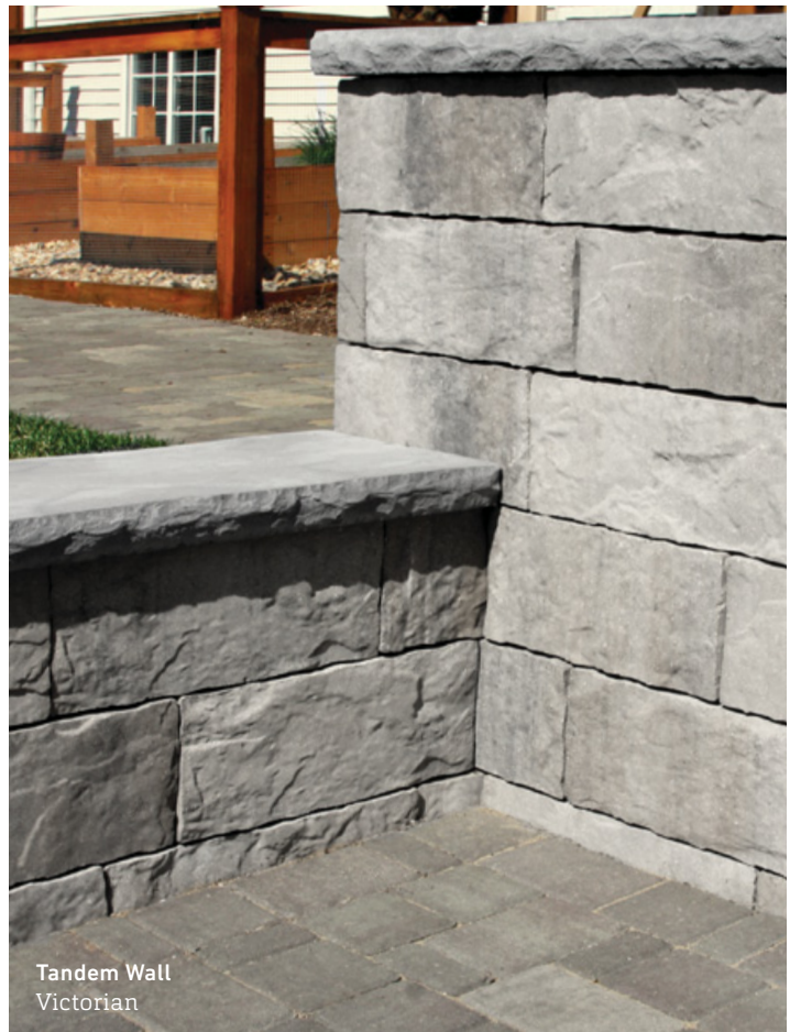
Tandem Wall Victorian