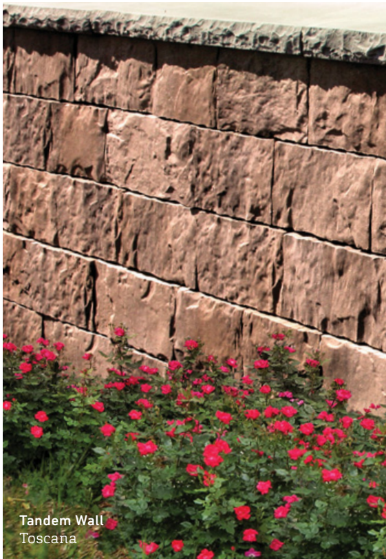
Tandem Wall Toscana