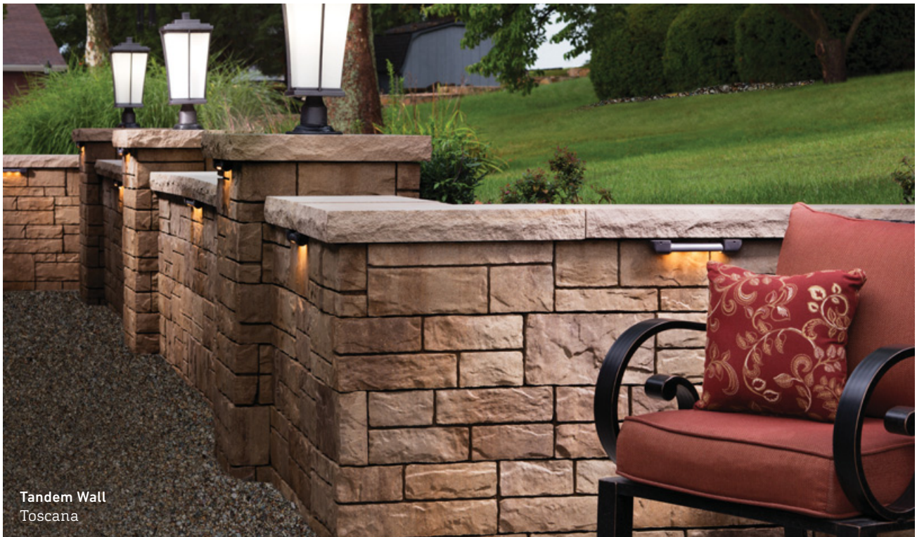
Tandem Wall Toscana