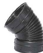
45° SNAP ELBOW