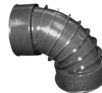
90° SNAP ELBOW